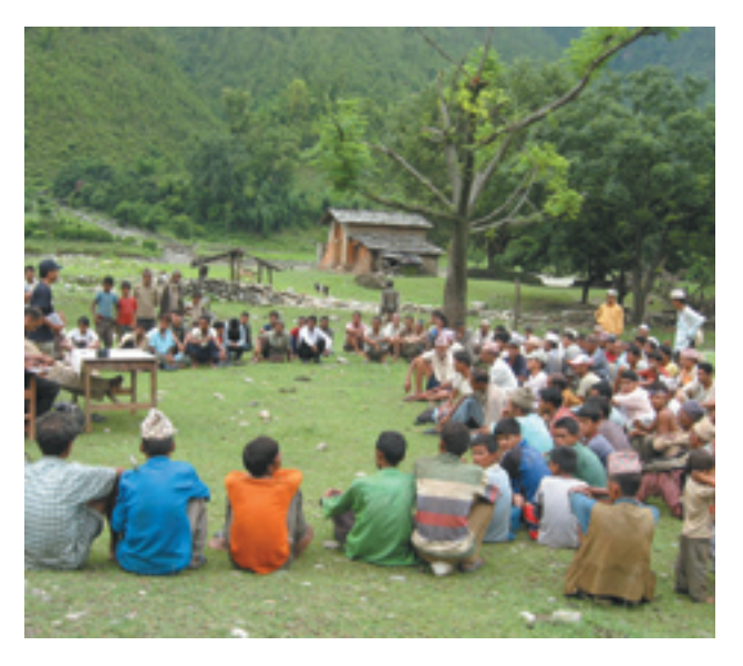
Meeting to discuss the potential impacts of the planned West Seti Hydropower Project, in Nepal, 2007. It is estimated that 15,000 people will be adversely affected by this project.

There is a need to strengthen efforts to evolve such visions, plans and approaches for the entire region and within each country.