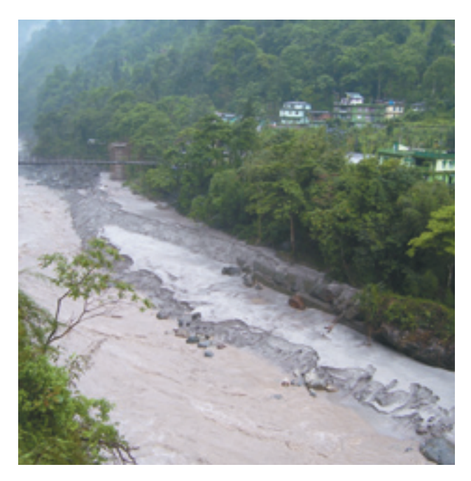
Silt accumulation upstream of Teesta V Dam, 2008. Siltation is a serious issue as it affects the performance and life of a project, and also deprives downstream plains of nutrients that have been the source of their fertility.

The impacts from transmission line construction will be an important issue in Pakistan, Nepal and Bhutan. A major impact will be felt in India in the Siliguri Corridor or "Chicken's neck" – the area between Siliguri and Bidhan Nagar in West Bengal – which is the only connection from the Indian mainland to the states in the northeast. This area is the only way to transmit power from Bhutan to India, and from India's northeast to the rest of the country; the transmission lines will have to be bunched together here. The Working Group on Power for the 11<sup>th</sup> Five Year Plan in India estimates that to transmit all the surplus power from northeastern India and Bhutan will require a set of transmission lines with a right of way about 1.5 km wide.<sup>109</sup>