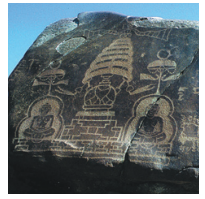
Rock carvings of a Buddha group and stupas near the Diamer-Bhasha Dam site that will be submerged by the reservoir, 2005.