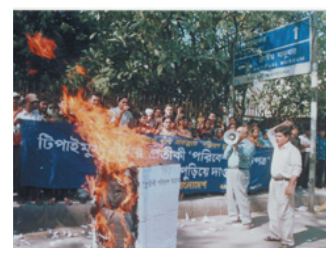
Protest in Bangladesh against the environmental clearance of Tipaimukh Dam in India, 2008. The dam will submerge 292 sq km, affecting 91 villages in India, and people in Bangladesh are concerned that the project will drastically and adversely alter river flow in the downstream region in Bangladesh, with severe social and environmental consequences.

Direct submergence of a large number of houses, villages, cultivated lands and forests remains a serious issue. For example, the Tehri project in Uttarakhand, India has led to the direct submergence of the town of Tehri, 37 villages fully and 88 partially. More than 10,000 families have been displaced.<sup>78</sup> The Tipaimukh project in Manipur, India, is going to submerge an area of 292 km<sup>2</sup>. The Environmental Impact Assessment (EIA) of the project boasts that it will have a "meagre impact," as it will submerge a population of only 2,027 in 313 households in 12 villages.<sup>79</sup> Although it does note that lands and farms of 91 villages will be submerged