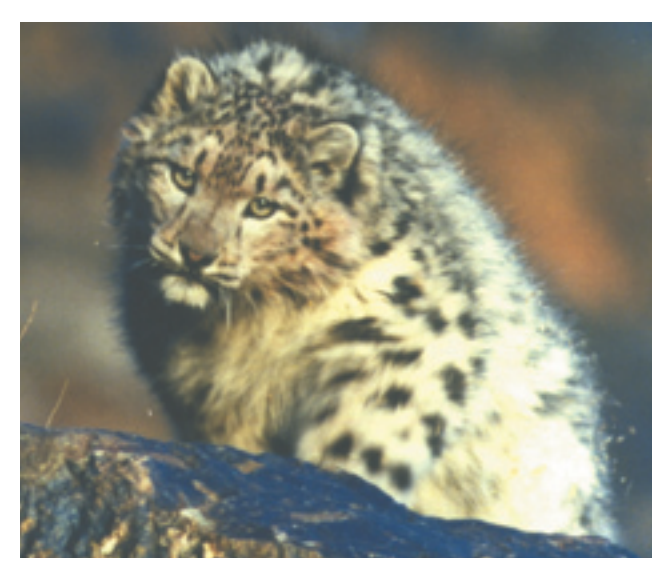
Snow Leopard. Dam building in the Himalayas is a threat to animals and endangered species such as the snow leopard.

The state is situated in the Eastern Himalaya and is the richest biogeographical province of the entire Indian Himalayan zone. The province has been