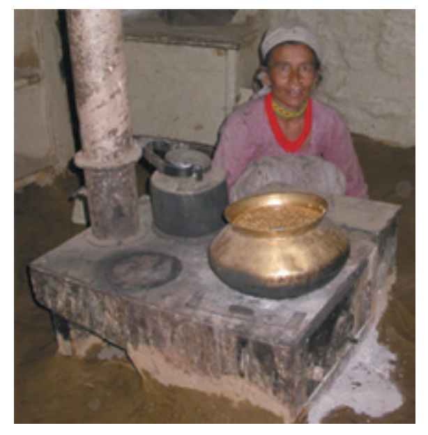
Woman without access to electricity in rural Nepal, 2005. A key issue is that planned hydropower projects in Nepal are not likely to to rural areas of Nepal but will export most of the power to India.

In India, hydropower projects are approved on the basis of power generation at 90% dependable flows. This is the "design energy" generation. Thakkar's analysis of 208 projects (30,740 MW) of the 228 operational projects in India as of March 31, 2007, showed that power generation at 184 of them was below the design energy.<sup>115</sup> The total capacity of these 184 projects is 25,214 MW – thus, 82% of the total analysed capacity is under-performing. This conclusion was based on generation figures for 1985-86 through 2007-08 obtained from the Central Electricity Authority. What is most important is that the actual 90% dependable generation achieved by these 184 projects was less than half the design energy. This means that projects have been heavily over-designed, and river flows over-assessed.