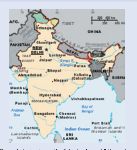
The red circle shows the "chicken's neck" through which all power from Bhutan and northeastern India will be transmitted to rest of the country. http://upload.wikimedia.org/wikipedia/en/d/d8/ Chickensneckindia.jpg

attempt at planning projects in such a way as to avoid or minimise displacement and environmental impacts. Social and environmental criteria are minimally considered in decision making and planning processes related to dam projects.