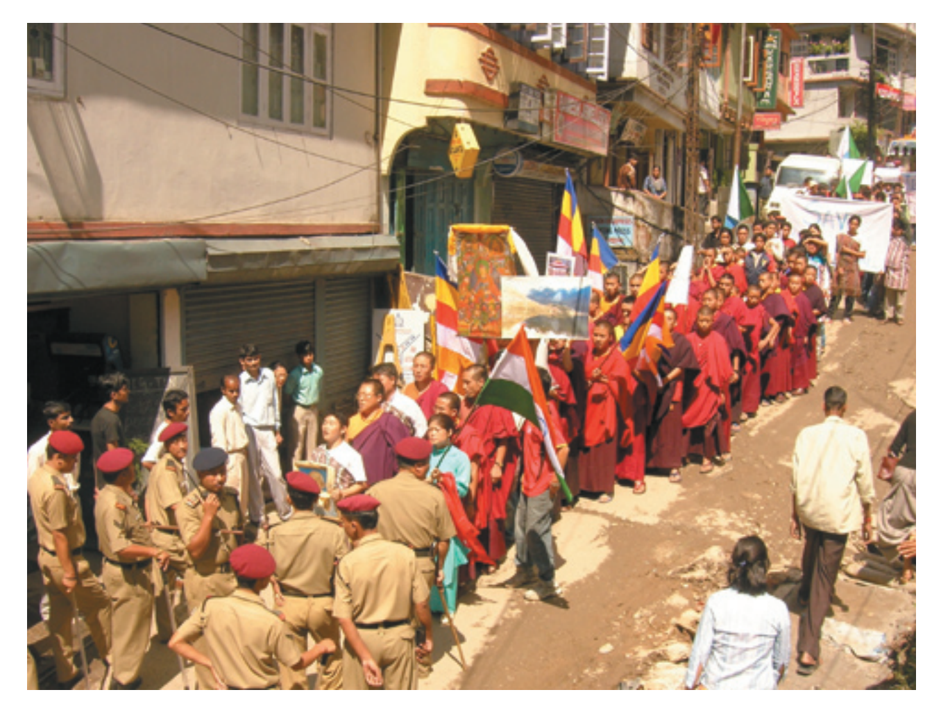
Protest against the Teesta Dams in Sikkim, India, 2007. In 2007, the Affected Citizens of Teesta staged a relay hunger strike against the projects for more than 500 days.

These and other trans-boundary water issues in the whole region will benefit tremendously from such networkbuilding between civil society and affected people's groups from all the countries in the region.