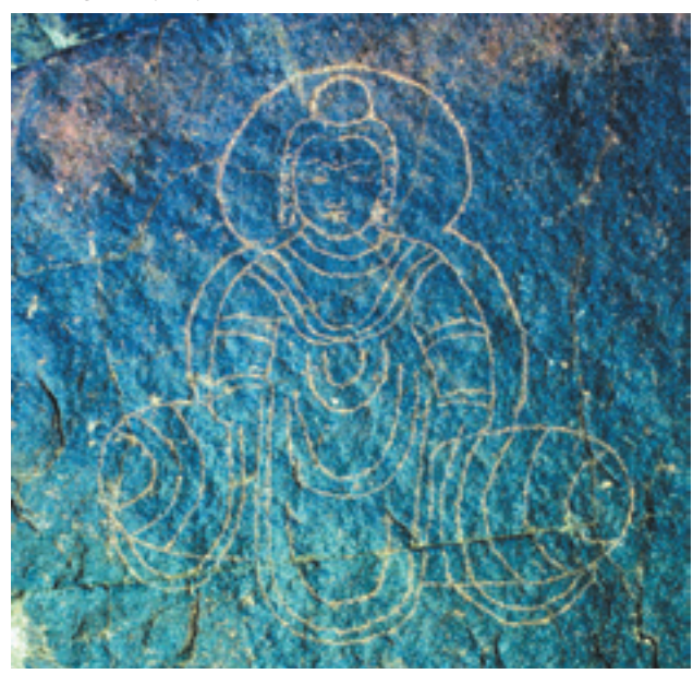
Ancient rock carvings of the Buddha near Diamer-Bhasha Dam site, 2005. A huge treasure trove of rock carvings of ancient times have been found in the area that will be submerged by the reservoir of the planned dam.

For example, Idu-Mishmi is the major tribe in the 3,000 MW Dibang Project area in Arunachal Pradesh, India. Raju Mimi, a local activist and journalist from the lower Dibang Valley, says: