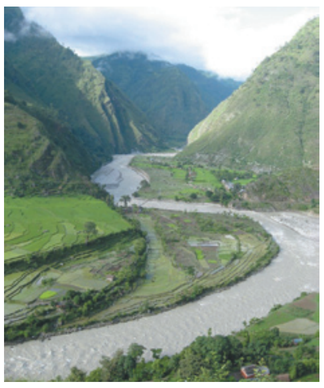
The Seti River near the planned West Seti Dam site in Nepal, 2007. The 750 MW West Seti project is set to begin construction even as the affected people are strongly opposing it.

Recent years have seen a renewed push for building dams in the Himalayas. Massive plans are underway in Pakistan, India, Nepal and Bhutan<sup>6</sup> to build several hundred dams in the region, with over 150,000 Megawatts (MW) of additional capacity proposed in the next 20 years in the four