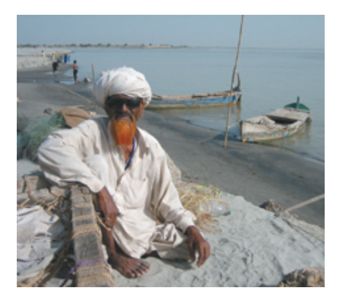
Fisherman on the Indus River, Pakistan, 2007. The planned hydropower projects are likely to submerge forests, farms and grazing lands, impact fisheries, cut-off access roads, and degrade water sources impacting millions of people along the way.

Consider the 2,000 MW Lower Subansiri project in Arunachal Pradesh, India, which is under construction. The people of Durpai Village, one of the affected villages, say that while two villages are shown to be losing land to submergence, many other villages and people will also be affected because their rice growing areas are affected by the project. They also say that the project requires 40 km<sup>2</sup> (4,000 ha) of forests, much of it for submergence. This forest area supports part of the jhum cycle of the local people, in addition to being a source of many other goods and services.