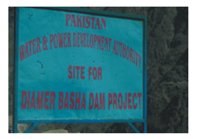
Sign of the planned Diamer-Bhasha Dam in Pakistan, 2007. The government is pushing for the immediate implementation of the massive 4,500 MW Diamer-Bhasha project in Pakistan.

been signed for the 300 MW Upper Karnali and 402 MW Arun-III projects.